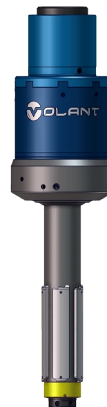
Tool Configuration with Integral Slip Dies